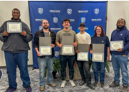
Floor Installation Technician

Monitor the College Dashboard for all the resources you'll need to market, promote, and deliver these courses when they launch. Stay tuned for more updates as we prepare to expand statewide!