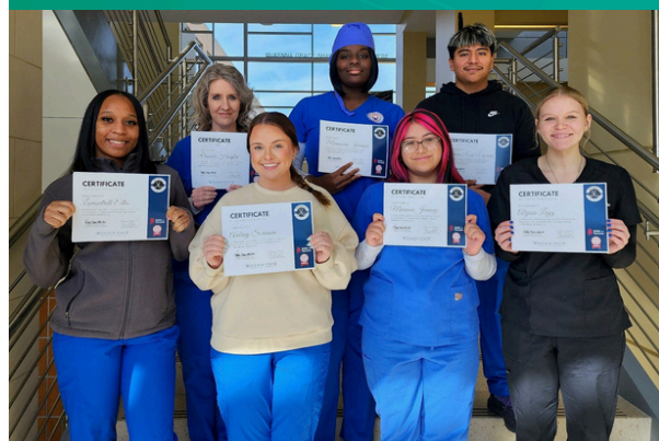
Nursing Support Technician