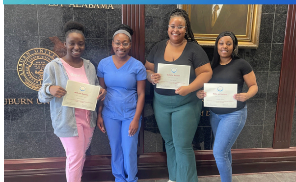
Community Health Worker